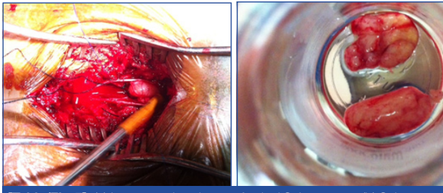
[Table/Fig-7]: (a) Intraoperative picture of spinal Schwanoma; (b) Schwanomas after being excised.

Postoperatively patient was relieved of the radiating pain and was ambulated on the third postoperative day with a lumbo – sacral brace. Post-spinal surgery she complained of increase in pain and size of the ankle swelling. However, due to financial and social constraint she refused surgery. She was followed up for 30 months and didn't show any signs of recurrence of pain or any swelling in the operated areas. As long as she followed up, she had pain around the