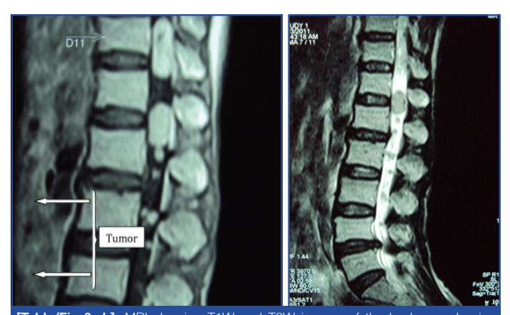
[Table/Fig-6a,b]: MRI showing T1W and T2W images of the lumbosacral spine showing the tumour.